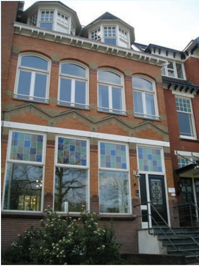
Karuna Office, Holland