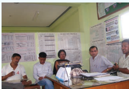
Health workers sharing about progress of prevention project