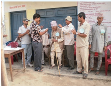
Share & Care inauguration, Madhesha, Sunsari