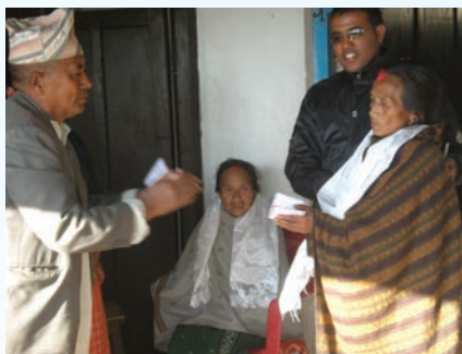
Female Community Health Volunteer being felicitated at Narayansthan

Apart from the lessons learnt from our own experiences, we saw some very good examples of well-organized grass-root structures for the implementation of community based health insurance schemes during our visit to India. It inspired us, and has influenced our strategies and approaches.