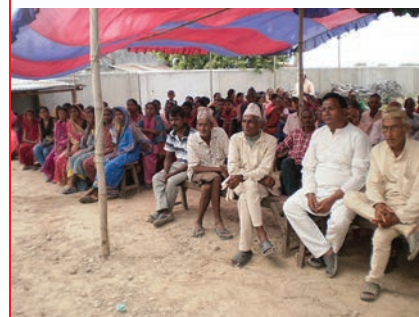
Service inauguration program, Madhesa, Sunsari

Two years of implementing the Training of Professionals project was completed this year. A total of 431 health professionals and managers from Kavre, Sunsari and Rasuwa districts have been trained on prevention of disability. It is phenomenal that we have supported to establish birthing centres and strengthened existing ones in Sub/ Health Post, strengthened Primary Health Care/ Out-reach Clinic and implemented prevention projects, and most importantly, we have been able to prevent children born with disabilities, in partnership with the existing government healthcare system.