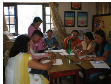
CBR Planning workshop, 2010

Empowerment of the CWDs and their families and the community in general, self-reliance and sustainability of the program are targets we have set for ourselves. The team is passionate, ambitious and determined to prevent avoidable disabilities and to improve the lives of CWDs in the coming years. But, of course we need the support and guidance from our partners, donors and stakeholders in this mission. Only together, we can make a change.