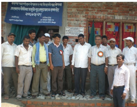
Birthing Center Inauguration, Bhokraha, Sunsari