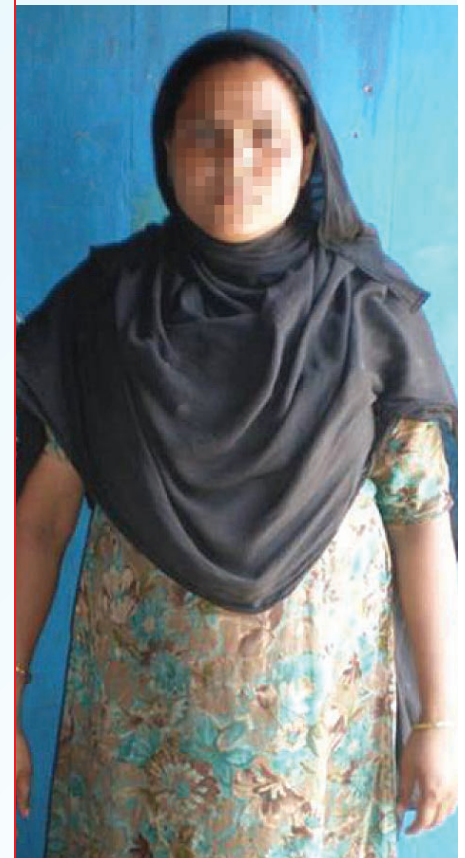
Relieved from fear of cancer

After a successful surgery he returned home and no longer has the contracture.