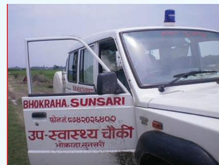
Ambulance providing service, Bhokraha, Sunsari

The two-year exit strategy has proved challenging. Based on the request from the communities and recommendations from different experts, Karuna Foundation has decided to extend technical and, in some exceptional cases, limited financial support to the programs for an additional two years, bringing the total program period to 4 years. Though the community has not taken full ownership yet, the extent of their involvement, ownership and leadership is increasing each day. Besides, Karuna is investing to strengthen their knowledge, self-confidence and empowerment.