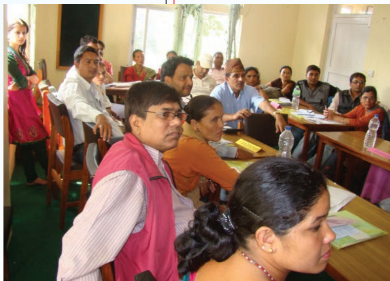
Presentation of re-planning during Review Workshop

In the year 2011, a separate training department has been established to handle the ToP project. We will continue the follow-up of prevention projects implemented in 2009 through integrated supervision and review. The training department will also work to develop the capacity and leadership of the health facility operation management committee to make them capable of leading and sustaining health programs at the local level. Secondary prevention will be a part of the training as required by the health workers in the coming year. Karuna staffs will also be trained to better equip them to provide technical support and to transfer leadership skills to the community.