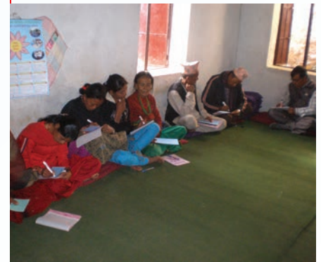
Implementation Planning Strategy Workshop, Chapakhori, Kavre

Goals: Through these strategies, Karuna aims to achieve 5-10 percent less birth defects among newborns; 30-40 percent less children developing disabilities caused by illness, accidents or malnutrition; a sustainable access to improved health services for 100,000 people; access to education, financial support and community life for 1,000 children with disability and their families; and, a proven successful, sustainable and replicable health care model.