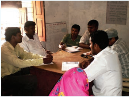
Community Based Rehabilitation committee meeting, Sunsari