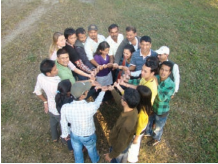
The Karuna Team