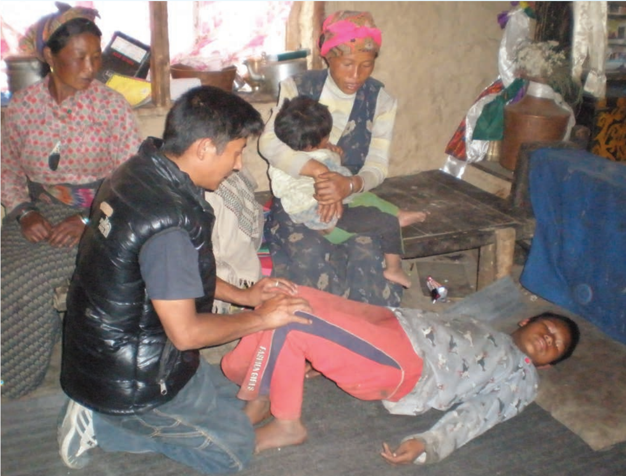
CBR worker providing physiotherapy, Rasuwa