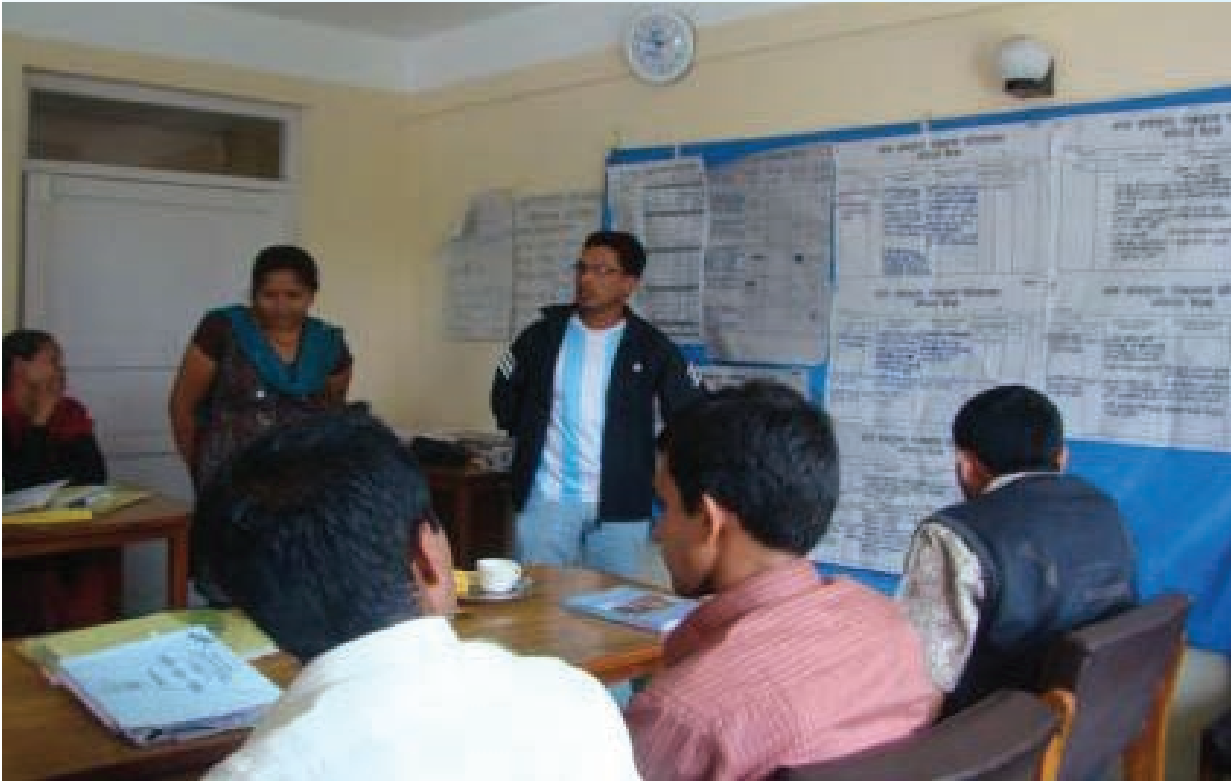
Participants presenting their plan during Review Workshop

disability before birth contribute 44%, during birth 46% and after birth 10% to disability causation. Therefore, we measure the effect of ToP on disability prevention by taking those health indicators of prenatal care (antenatal visits, iron intake and vaccination against tetanus), intra-natal and postnatal care (delivery, postnatal care and Vitamin A intake), early childhood care (immunization, growth monitoring, neonatal care) where we have made significant changes. Net gain in health indicators is thus calculated and converted to the number of children that could have been saved from disability using statistical tools which take into consideration the above mentioned propositions and assumptions.