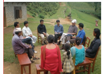
GTZ consultant interacting with community members on Health Insurance, Chapakhori

We have confidence that governance will become more decentralized, and the state power more diffused. This will allow communities and people to participate more actively and take ownership of policies that are implemented at the local level. People can then take the initiative to start new programs and take leadership to develop their communities.