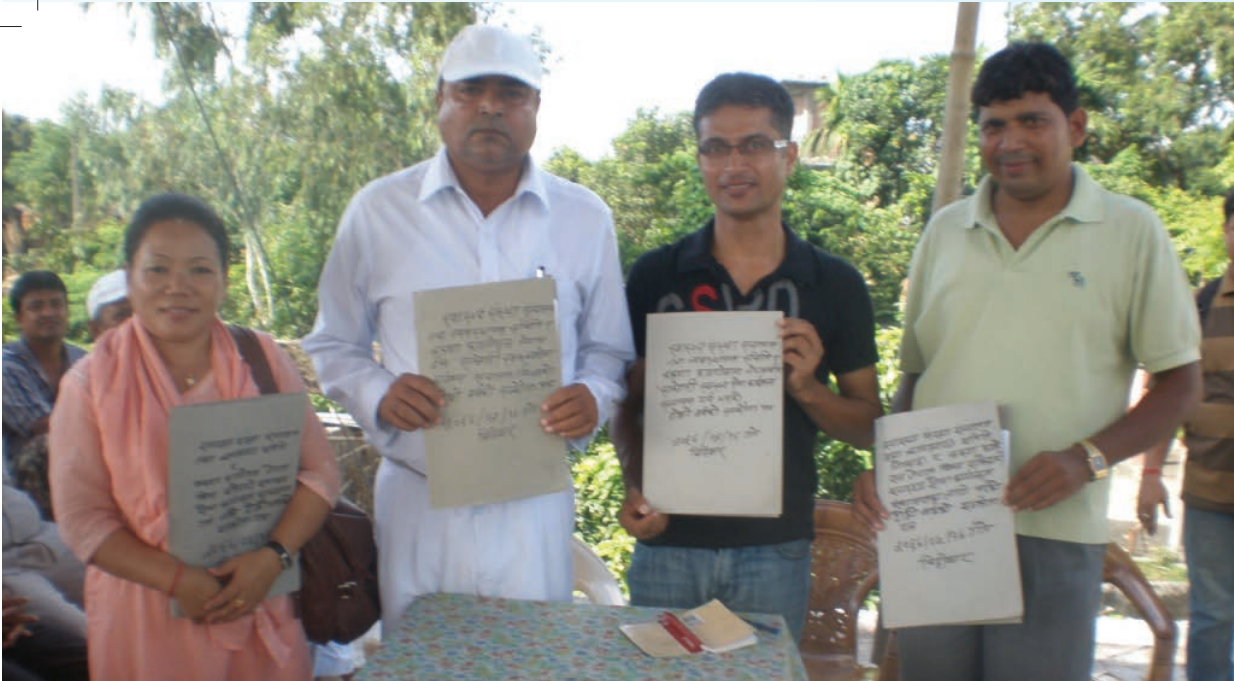
Second Year Agreement, Bhokraha, Sunsari