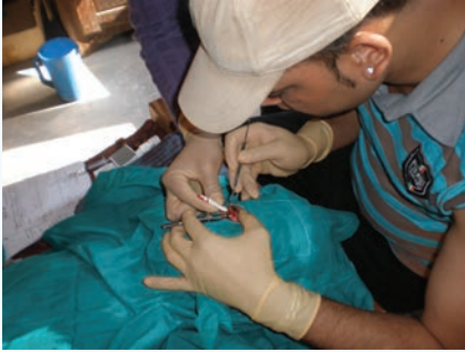
Health Camp, Kavre