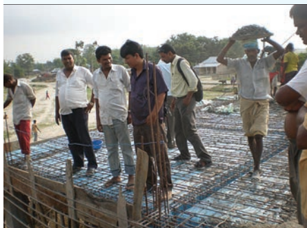
Birthing Center Slab Construction, Bhokraha, Sunsari

Another achievement was to directly and concretely influence the lives of 400 children with disability in all the project villages. About 12 percent of 400 children have been successfully rehabilitated in the year 2010. Strong coordination and collaboration with local governmental and non governmental bodies was created in the project areas. Simultaneously, we continue to face enormous challenges to rehabilitate the children with intellectual and multiple disabilities. But to have successfully created recognition and respect for persons with disability by families, community and others is a priceless achievement.