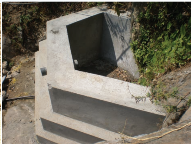
Water Project supported by Madat Nepal and organised by Karuna, Mechchhe