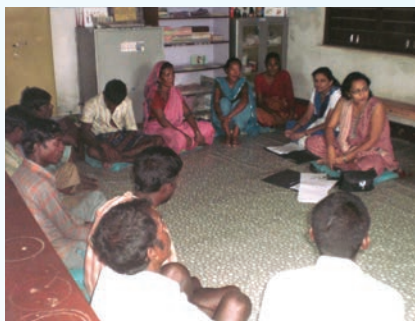
Social Welfare Council Evaluation