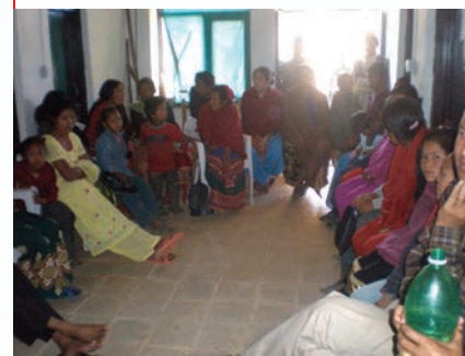
VDR Formation, Narayansthan, Kavre

Furthermore, we need to intensely work on building the knowledge and capacity of the health facility operation and management committees, health and rehabilitation staffs and other key persons to be able to reach the entire community. Health insurance education, transferring leadership and management skills and principles as well as communication and mobilization skills are high priority in the New Year.