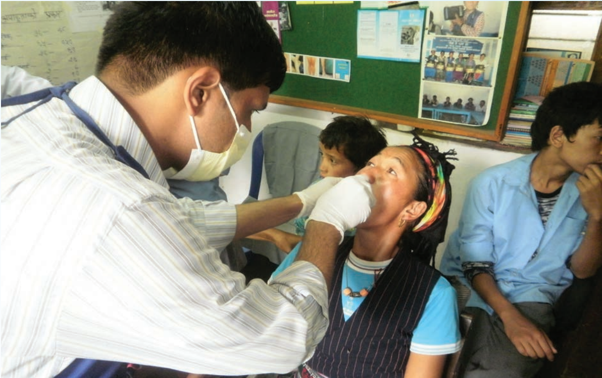
Health camp, Rasuwa

Most of the caretakers of Children with disability (CWD) seemed satisfied with KFN support through the local HFOMC. The District Health Office, health workers and the members of HFOMC also had recognized the need for support to the CWD and were looking forward for more support for the livelihood of the families of CWD. The family members of the CWD were regularly getting information on prevention of health problems. The parents were able to provide simple physiotherapy to their children, which they had learned from the local CBR workers. Most of the children with disability are enrolled in school for education. The HFOMC had supported the cost of school stationeries; the cost for books was being borne by the KFN.